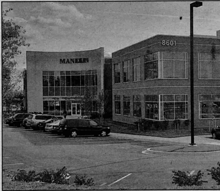
Manekin's Corporate Headquarters